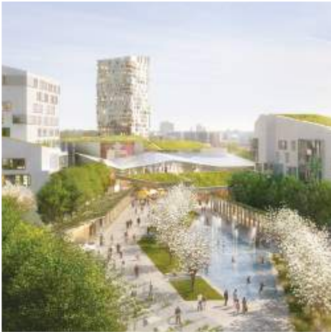
EUROPEA PROJECT, PLATEAU DU HEYSEL, BRUSSELS (IN PARTNERSHIP WITH J.P VIGUIER)