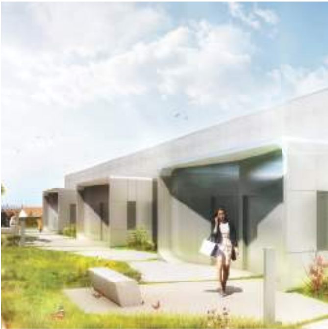
HIA OF PERCY, SERIOUS BURNS CENTER