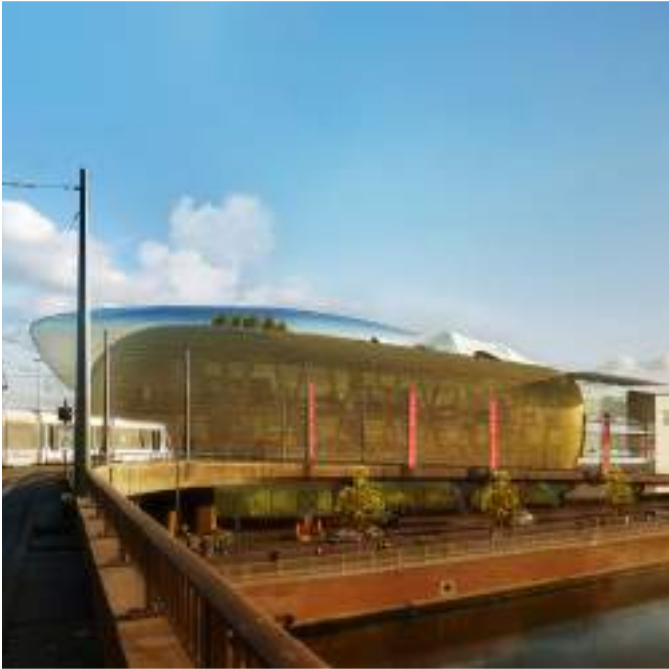
DOCKS BRUXSEL, BRUSSELS