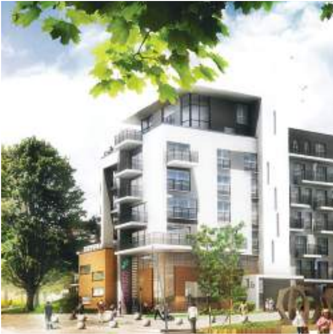
UNIVERSALIS PARK, BRUSSELS