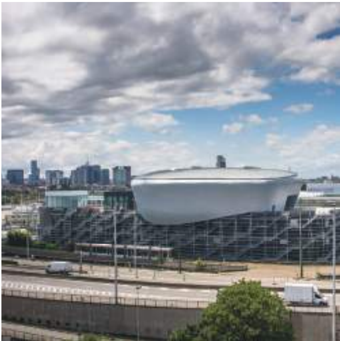
DOCKS BRUXSEL, BRUSSELS