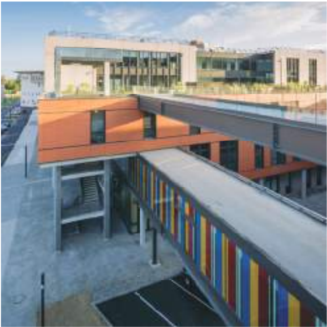
URM PURPAN, CHU OF TOULOUSE