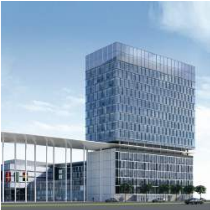
EUROPEAN PARLEMENT, LUXEMBURG