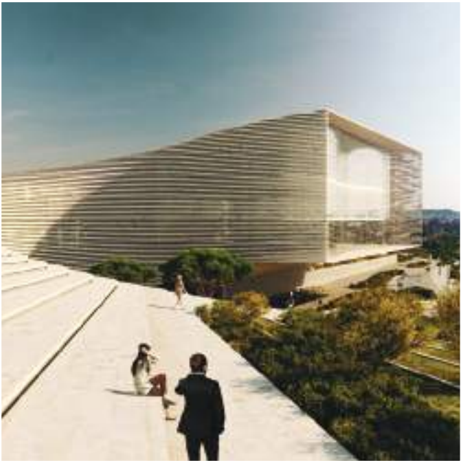
NATIONAL LIBRARY OF JERUSALEM