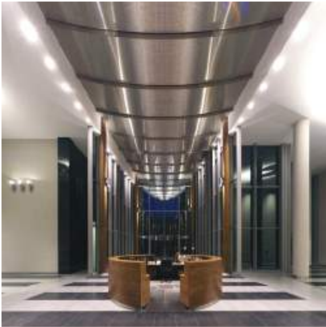
ELLIPSE BUILDING, BRUSSELS