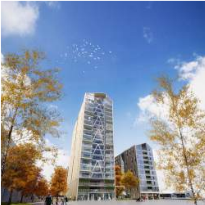
SILVA TIMBER TOWER, EURATLANTIQUE, BORDEAUX