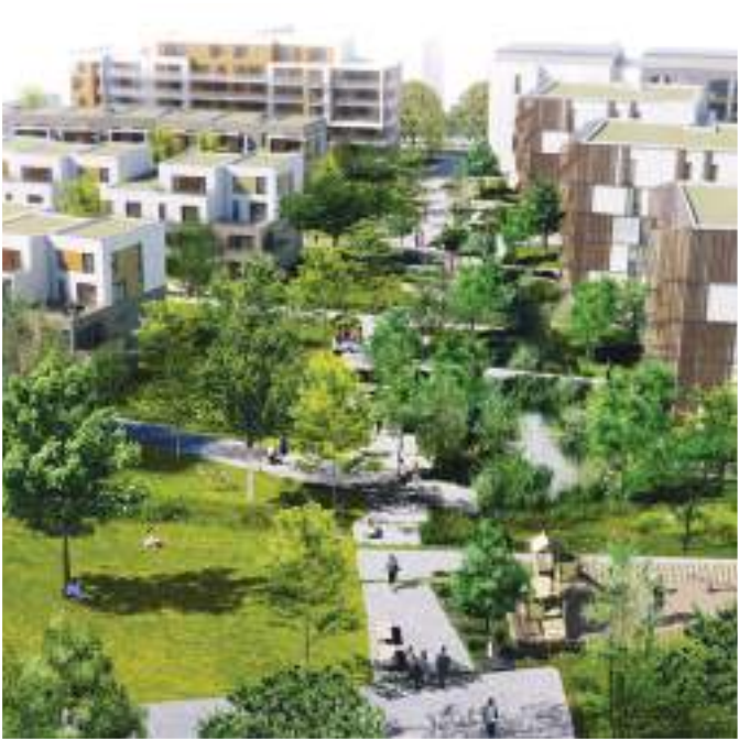
ECO QUARTIER LES AKÈNES, BORDEAUX