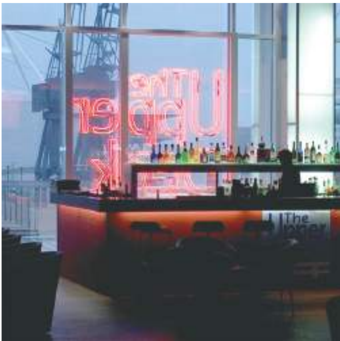
NOVOTEL EXCEL, LONDON