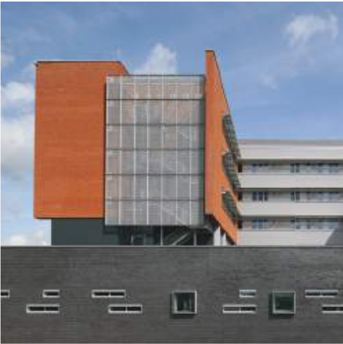
NEW CIVIL HOSPITAL MARIE CURIE, CHARLEROI