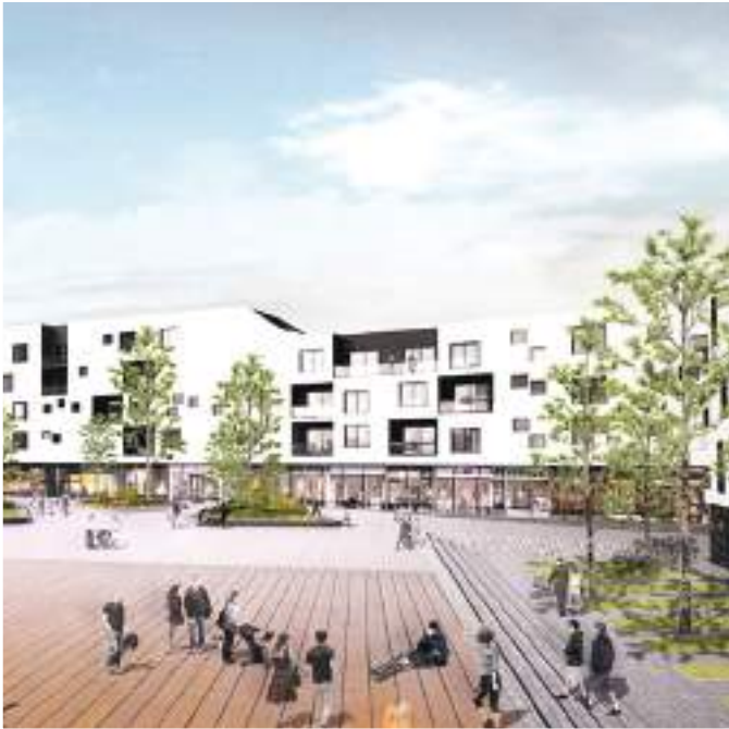
URBAN RENEWAL OF ANDENNE'S CITY CENTRE