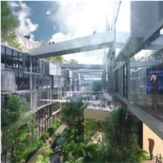
NEW HEADQUARTERS OF BNP-PARIBAS-FORTIS, BRUSSELS