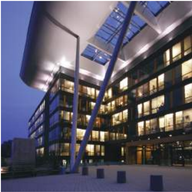
AGORA BUILDING, COUNCIL OF EUROPE, STRASBURG