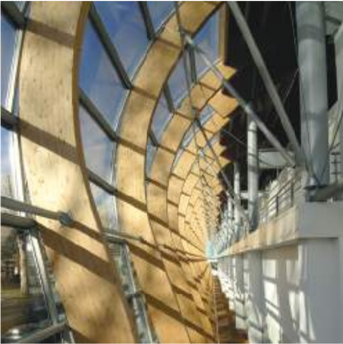
DIRECTORATE OF QUALITY OF MEDICINE, STRASBOURG