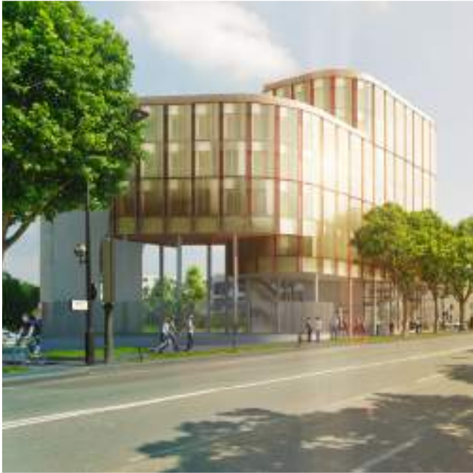
OPALIA BUILDING, PORTE D'IVRY, PARIS