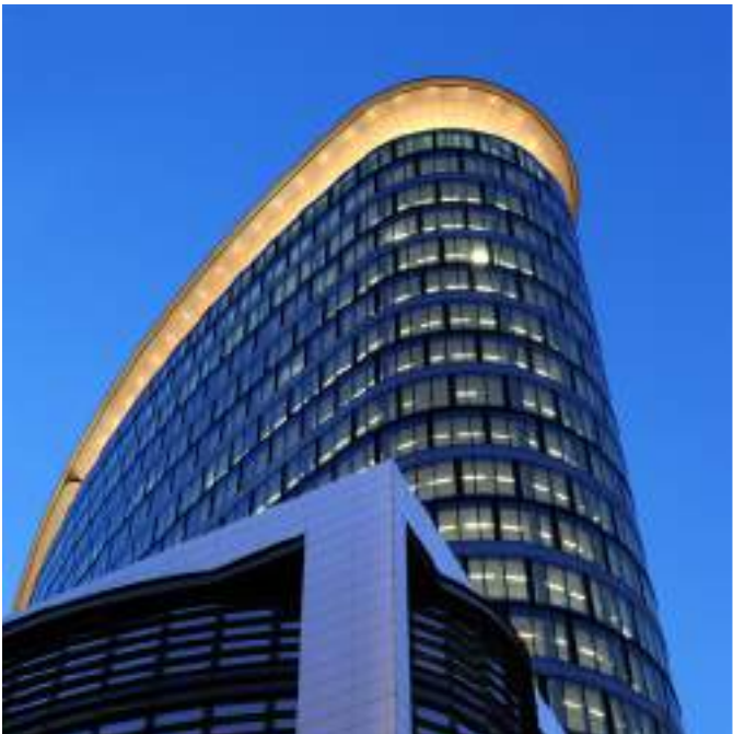
COVENT GARDEN, BRUSSELS