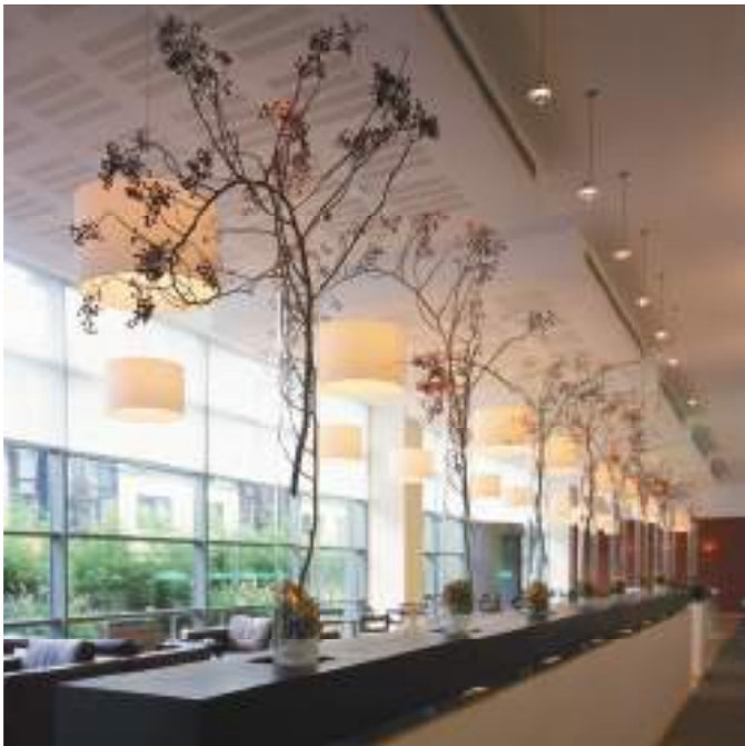
CLUB ASPRIA, BRUSSELS