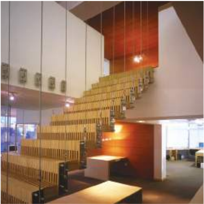
ART & BUILD' STUDIO, BRUSSELS