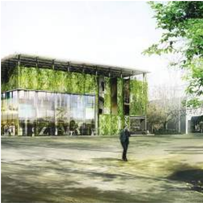
FROYENNES RETAIL COMPLEX, TOURNAI