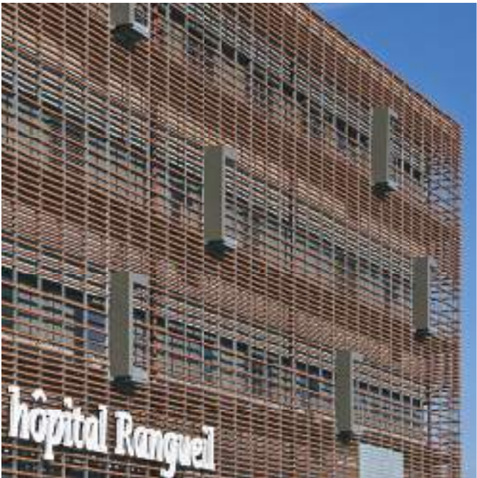
HOSPITAL OF TOULOUSE RANGUEIL