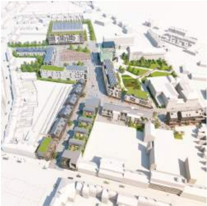
REVITALISATION DU CENTRE DE LA VILLE D'ANDENNE