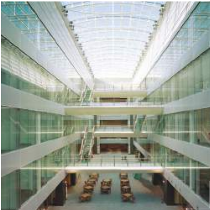
COCA COLA EUROPE, BRUSSELS