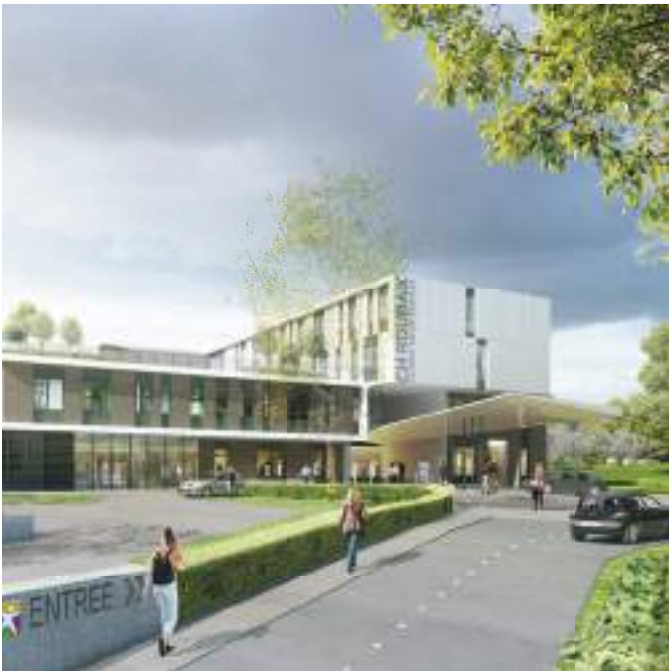
ROUBAIX HOSPITAL COMPLEX, NEW MOTHER, CHILD AND INFANT CENTRE