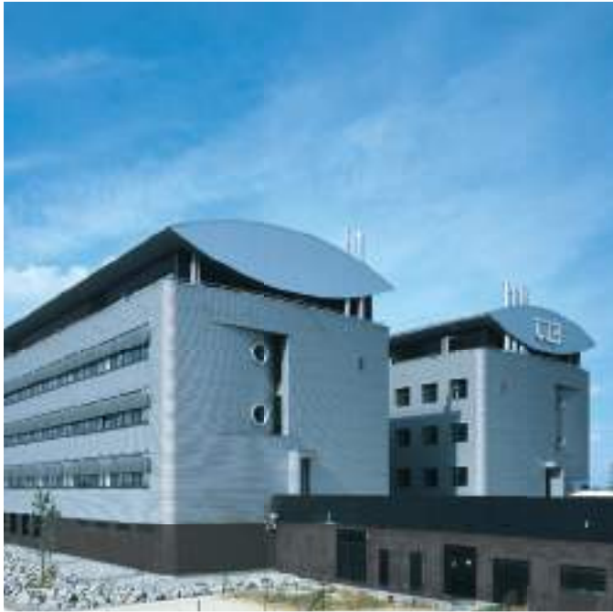
ULB CRB, AÉROPOLE DE CHARLEROI