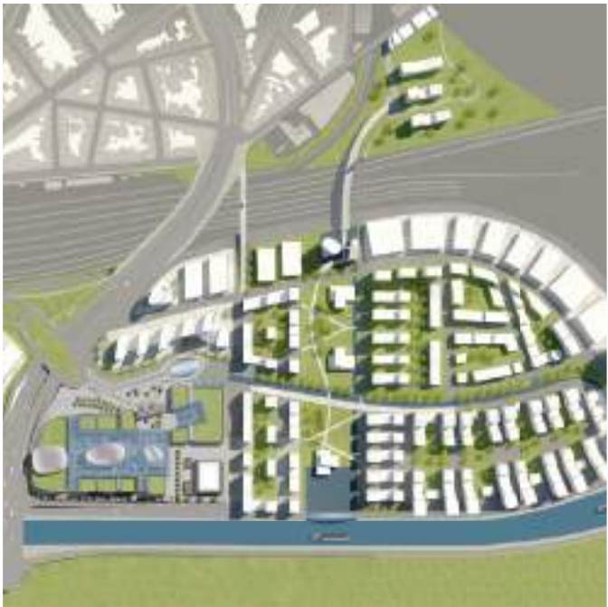
ECO QUARTIER WATERWALK, BRUXELLES