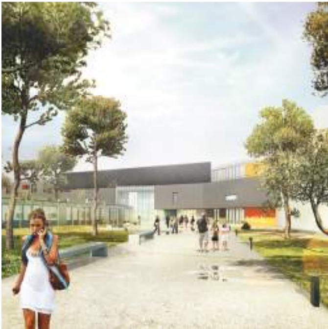
CHU OF BORDEAUX - NEW HEPATOASTROENTEROLOGY CENTRE