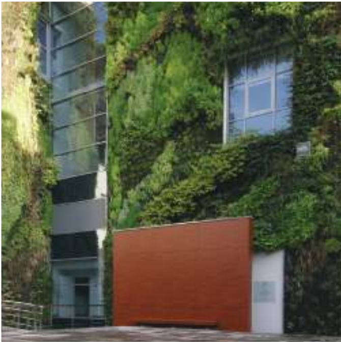
BRUSSELS REGIONAL COUNCIL