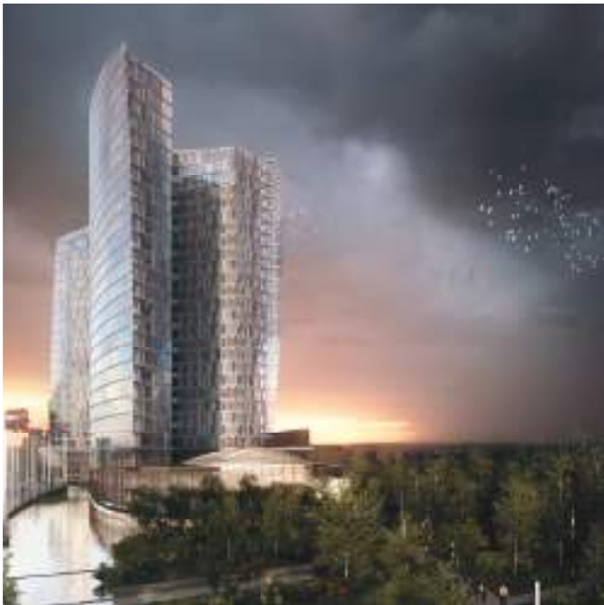
EUROPEAN PATENT OFFICE, RIJSWIJK, NETHERLANDS