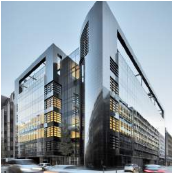
BLACKPEARL BUILDING, BRUSSELS, BATEX 2012