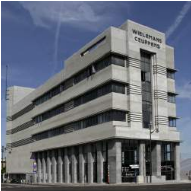
WIELS, CONTEMPORARY ART CENTRE, BRUSSELS