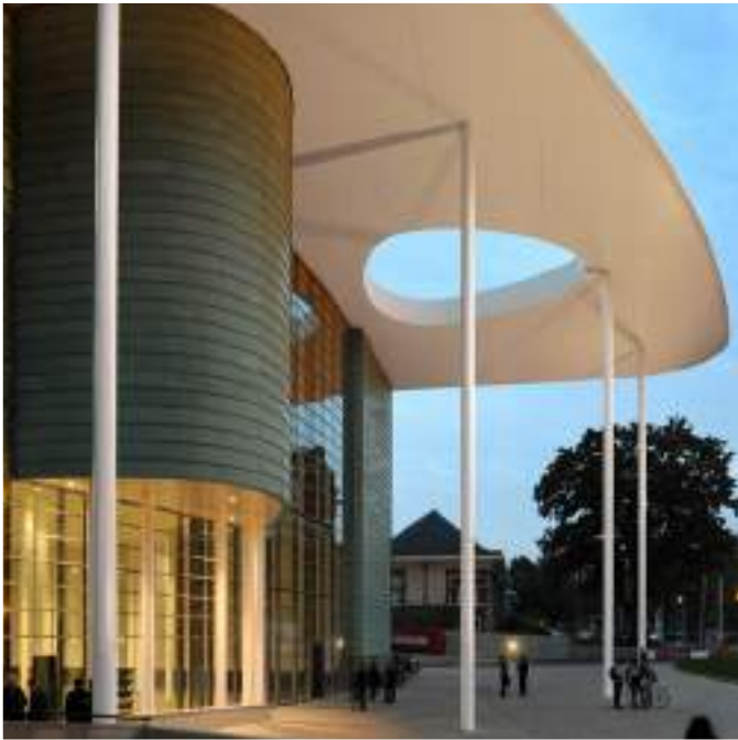
SOLVAY BRUSSELS SCHOOL OF ECONOMICS & MANAGEMENT